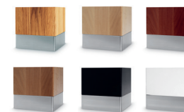
Square 12x12 cm Available in oak, beech, mahogany, black and white