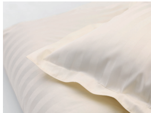
SATIN STRIPE BEIGE