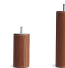
Round Ø 5,5 cm Height 12 and 20 cm Leather