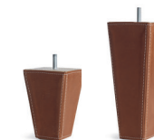
Tapered 12 and 20 cm Leather