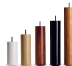
Round Ø 5,5 cm Height 12, 16, 20, 23 and 30 cm Available in white, beech, mahogany, black, oak and walnut