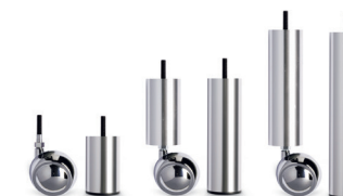
Aluminum With or without castors Height 8, 16 and 23 cm