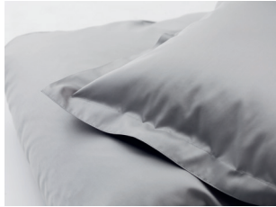
SATIN PLAIN GREY