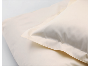
SATIN PLAIN BEIGE