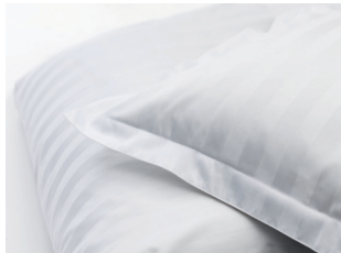
SATIN STRIPE WHITE