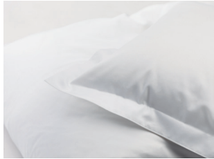
SATIN PLAIN WHITE