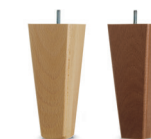
Tapered 20 cm Available in beech, black, mahogany, oak, cherry and walnut